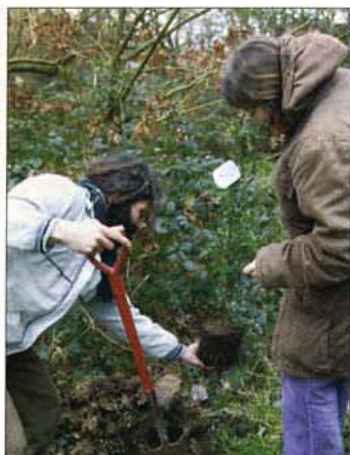
Planting an apple tree

One Tree Allotments is located in Honor Oak, SE23 ( www.othas.org.uk ); email vice chair Ian White on s_london_ari@btinternet.com Honor Oak rail.