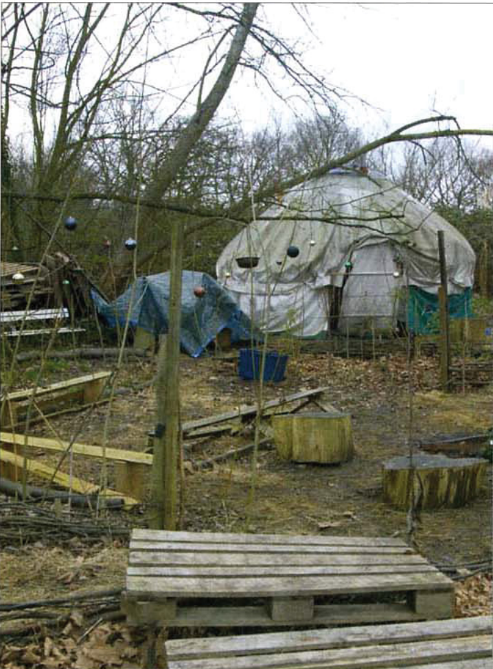
One-bedroom yurt for rent in Honor Oak. Needs some work