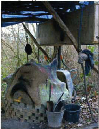
The natural oven