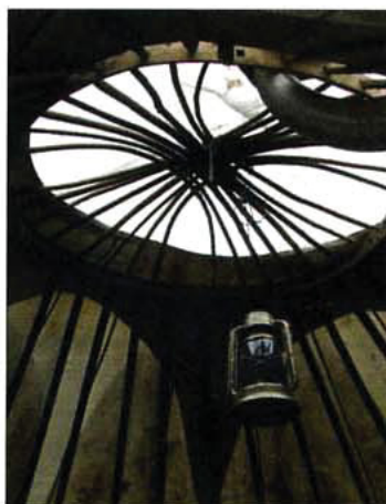
Inside the yurt