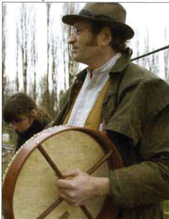
The tambourine man