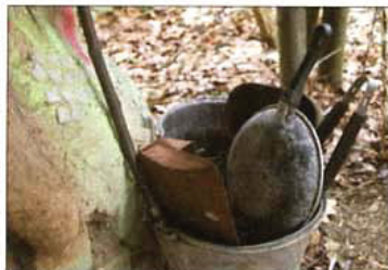
Tools of the eco-trade